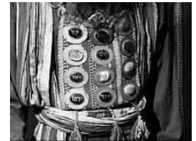
Urim and Thummin

There are however various theories and suggestions about the true meaning of this star. One theory is that the two opposite facing triangles represent the relationship between God and the Jewish people. Another theory is that the Star of David is modeled after the Urim and Thummin that the high priest of the Levitical priesthood wore. Finally, the Star of David is used in conjunction with icons such as the Swastika (Anti-Semitic) and the Ankh (an Egyptian symbol).