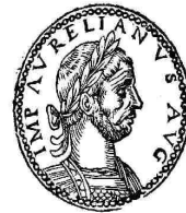
Emperor Aurelian (270-275 AD)

“In 274 C.E. the Roman Emperor Aurelian begins new Sun cult, the “Invincible Sun.” The sun was worshipped in a splendid temple, served by pontiffs who were raised to the level of the ancient pontiffs of Rome, celebrated every fourth year by magnificent games; Sol Invictus (Invincible Sun) was definitely promoted to the highest rank in the divine hierarchy and became the official protector of the Sovereigns and of the Empire” (Nazarene of Mount Carmel, 2006).