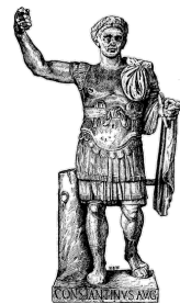
Constantine the Great

Sunday, also known as Day of the Sun and Dies Solis, has officially been a worldwide day of worship since the rule of Constantine the Great. This day was “legalized” as the day of worship in the year 321 A.D. However, this “ Sunday legislation ” was not relevant to the teachings of “Jesus” in the so called Christian movement. “In fact the emperor Constantine’s Christianity was ambiguous [and placated his fellow pagans]. His family owed traditional allegiance to the Sun-god; the famous vision of the cross as he marched on Rome came to